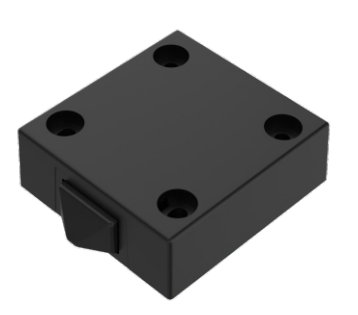
Wireless Sliding Switch

Read instructions carefully before installation