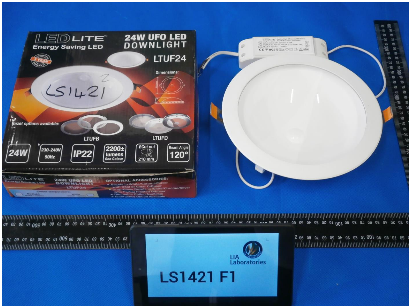
Figure 3. Product image