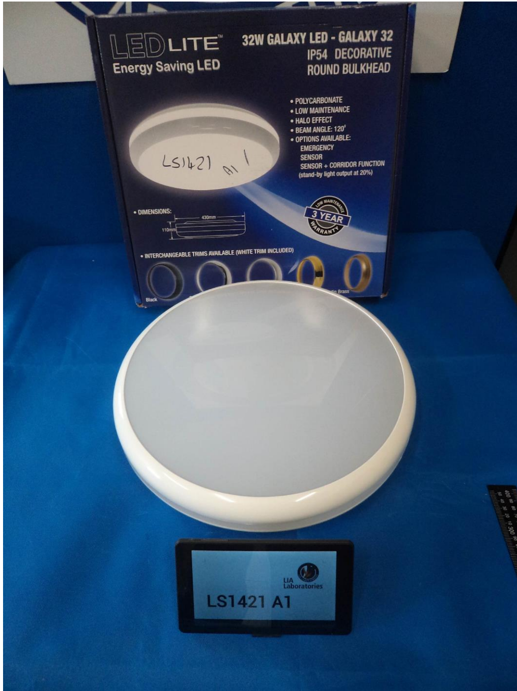
Figure 3. Product image