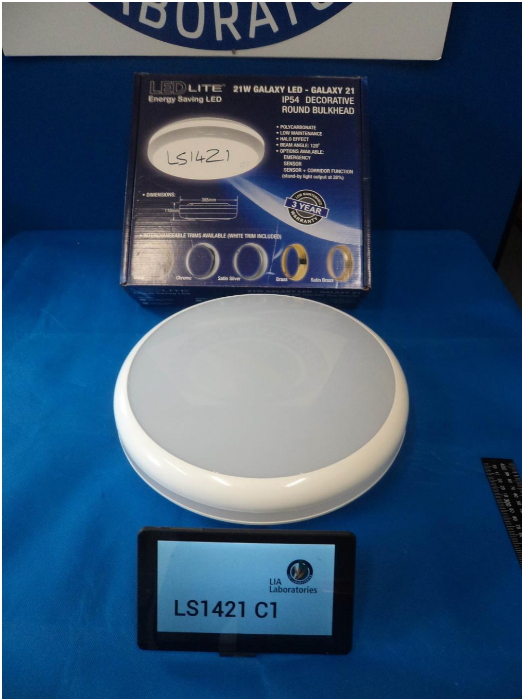
Figure 3. Product image