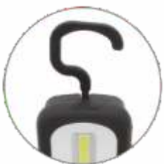
Hanger & Belt Clip