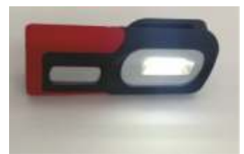
Dual Colour LED: Red & White