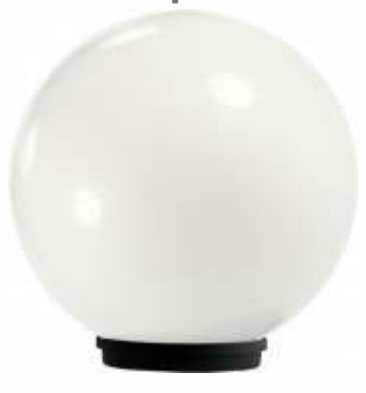
FE6000P - Ø200mm FE6001P - Ø250mm