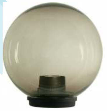
FE6000FU - Ø200mm FE6001FU - Ø250mm