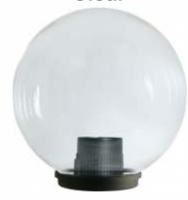
FE6000TR - Ø200mm FE6001TR - Ø250mm